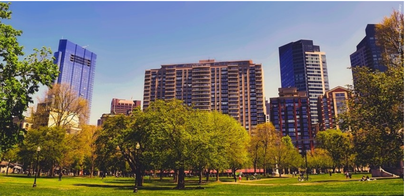
Urban Green Spaces.