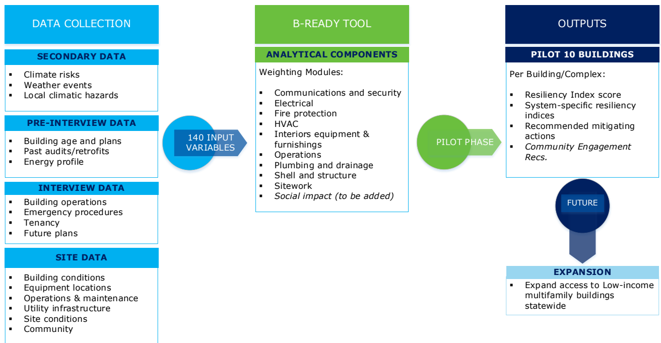
Figure 1. Schematic of B-READY Resilience Assessment®

To pilot B-READY and the resilience assessment process, DNV GL worked with NYCHA and NYSERDA to select 10 NYCHA buildings for assessment, with the goal of choosing a geographically, demographically, and architecturally diverse assortment of buildings. Once the 10 buildings were selected, DNV GL proceeded with data collection and analysis.